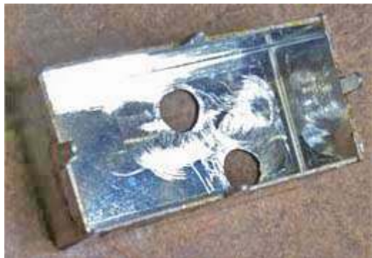
The cover for the VCO has been removed and two holes drilled for access to tuning slugs located beneath the cover.

(b) You will need to drill two holes in the cover so you have access to the tuning slugs underneath, then clean all debris from the holes. See picture below.