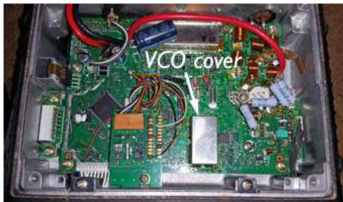
VCO cover is in the center front of the main circuit board.