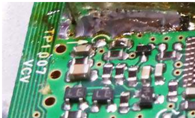
Close-up showing location of test point TP1007 (VCV).

this point, you should have transmit and receive, but remember you still need to tune the receiver to get good sensitivity.