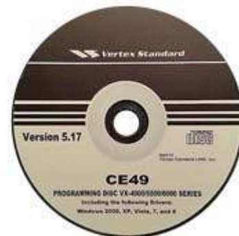
Vertex Standard CE49 programming disc.