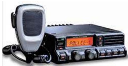
Vertex Standard VX-4000 transceiver

These FM radios are quite suitable for conversion from commercial frequencies to the amateur bands.