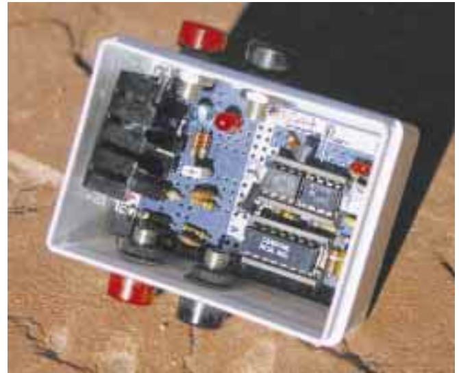
Above: Prototype charge controller on perf board.

The second and third alignment steps involve setting the low and high points that the battery will alternate