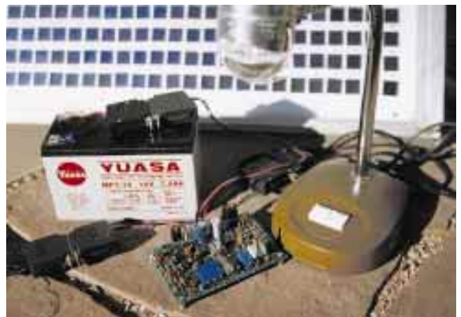
Above: Charge controller circuit board in action.

Comparator U2 is used to control power to the rest of the charge controller circuit. When the solar panel voltage is lower than the battery voltage, the rest of the circuitry is disabled, reducing night time idle current to the few milliamps consumed by U2 and its associated input circuitry. When the solar panel voltage rises above the battery voltage, the output of U2 goes negative, switching on transistor Q2 which provides power to the rest of the circuit. Resistor networks R1/R13 and R2/R4 scale the battery and solar panel voltages to a range that is useful to U2. Capacitor C23 prevents oscillation in the comparator at start up. Voltage regulator U4 is used as a reference for the battery set points, the reference points are adjusted via resistor network R11, R12, and R3. Comparators U1A and U1B monitor the battery voltage and switch states when the battery is fully charged (U1B) or has dropped to a voltage where charging should resume (U1A). The comparators drive