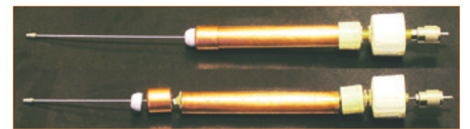
Figure 2 — Details of final assembly of coaxial dipole.

There isn't an exact length required for the lamp tubing or the stainless whip. These