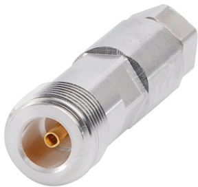
Type N Female for 1/4 in FSJ1-50A cable