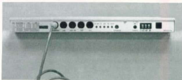
Level adjustments and DIP switches are readily accessible at the rear panel. Shielded DIN cables make hookup easy and clean, and prevent rfi.

In the world of repeater control, only ACC's RC-850 controller offers higher performance. And in the RC-96 controller's price range, nothing else comes close.